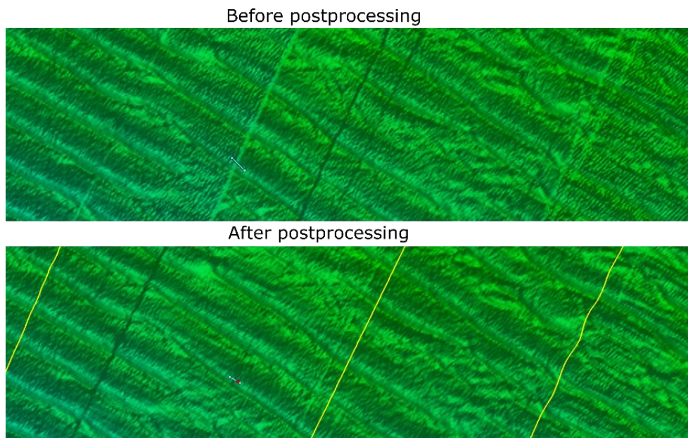
Figure 1 Influence of insufficient sound velocity sampling results in along-track stripes between adjacent MBES track lines. Postprocessing can correct for it just to a certain extent.

Insufficient water column sampling leads to artefacts in the bathymetry and backscatter data. In particular, the bathymetry can be deteriorated since the sound velocity is required for the calculation of the water depth from the travel time of the acoustic signal. With sophisticated software, the artefacts can be reduced to some extent (see Figure 7).