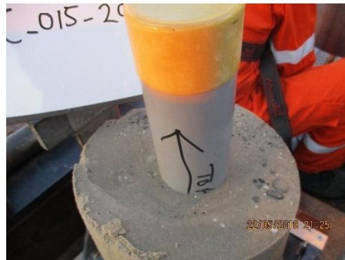
Figure 2 Example of a photo taken on the vessel from a seabed sample acquired with a Box Corer

Coarse grains, such as gravel or shell fragments, require a larger sample size (e.g., 200 g) in order to receive a reliable grain size analysis in the lab. In addition, a good documentation on the vessel, including a Photo (see Figure 8), improves the acoustic analysis significantly without additional effort.